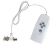
PFM820 UTC Controller