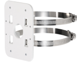
PFA152 Pole mount